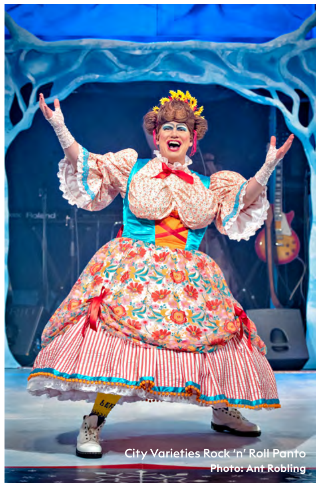
City Varieties Rock 'n' Roll Panto

* Leeds Grand Theatre was closed for maintenance works for three months