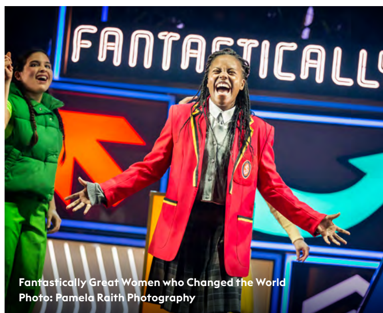
Fantastically Great Women who Changed the World

Whilst the post-Covid years have been challenging for everyone in the sector, we are seeing a steady recovery in our audience numbers. We are now looking to improve our reach within the city and beyond and are committed to ensuring that both our artistic programme and our audiences reflect the vibrant diversity of our city and of our region.