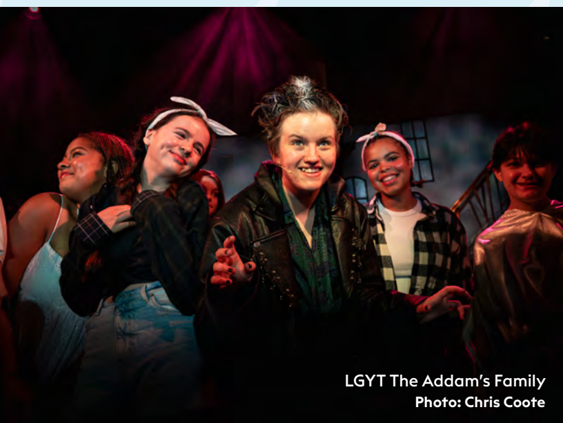
LGYT The Addam's Family