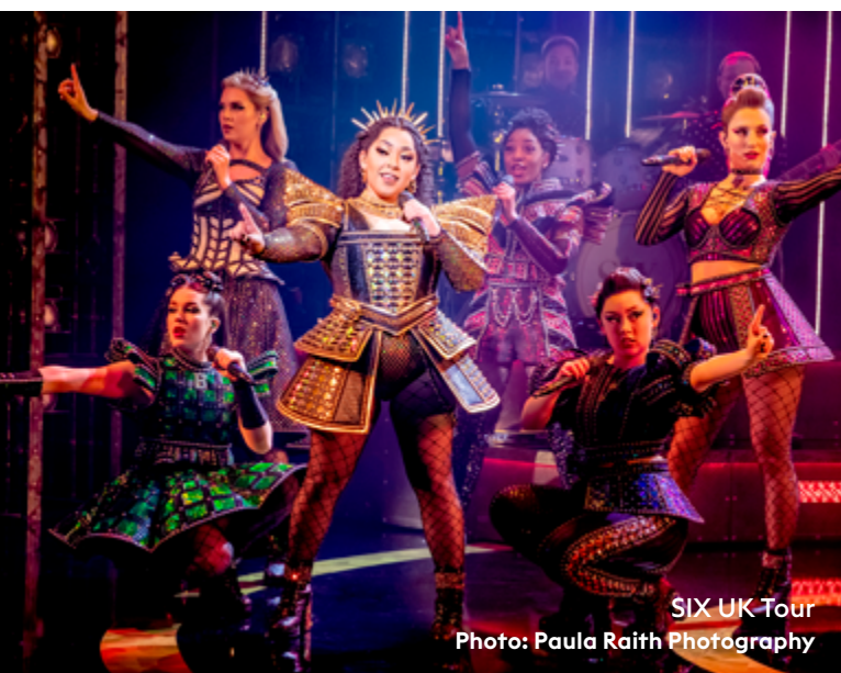
SIX UK Tour