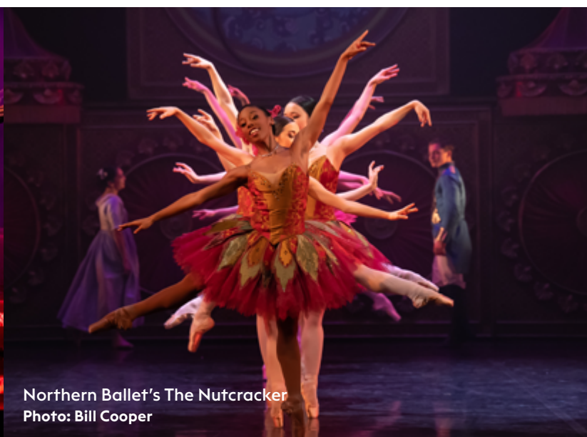
Northern Ballet's The Nutcracker