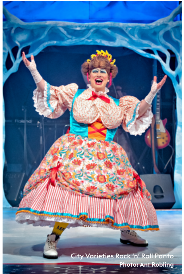
City Varieties Rock 'n' Roll Panto

Whilst the post-Covid years have been challenging for everyone in the sector, we are seeing a steady recovery in our audience numbers. We are now looking to improve our reach within the city and beyond and are committed to ensuring that both our artistic programme and our audiences reflect the vibrant diversity of our city and of our region.