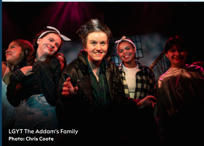
LGYT The Addam's Family