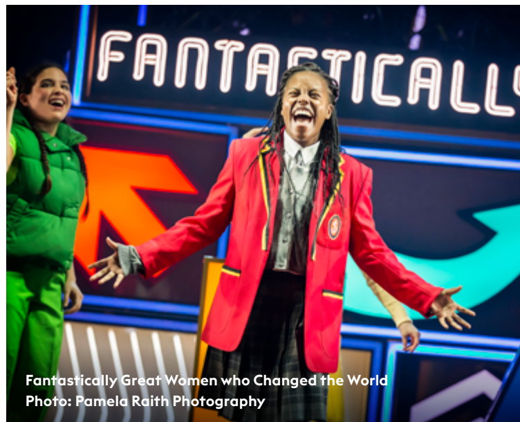
Fantastically Great Women who Changed the World

Whilst the post-Covid years have been challenging for everyone in the sector, we are seeing a steady recovery in our audience numbers. We are now looking to improve our reach within the city and beyond and are committed to ensuring that both our artistic programme and our audiences reflect the vibrant diversity of our city and of our region.