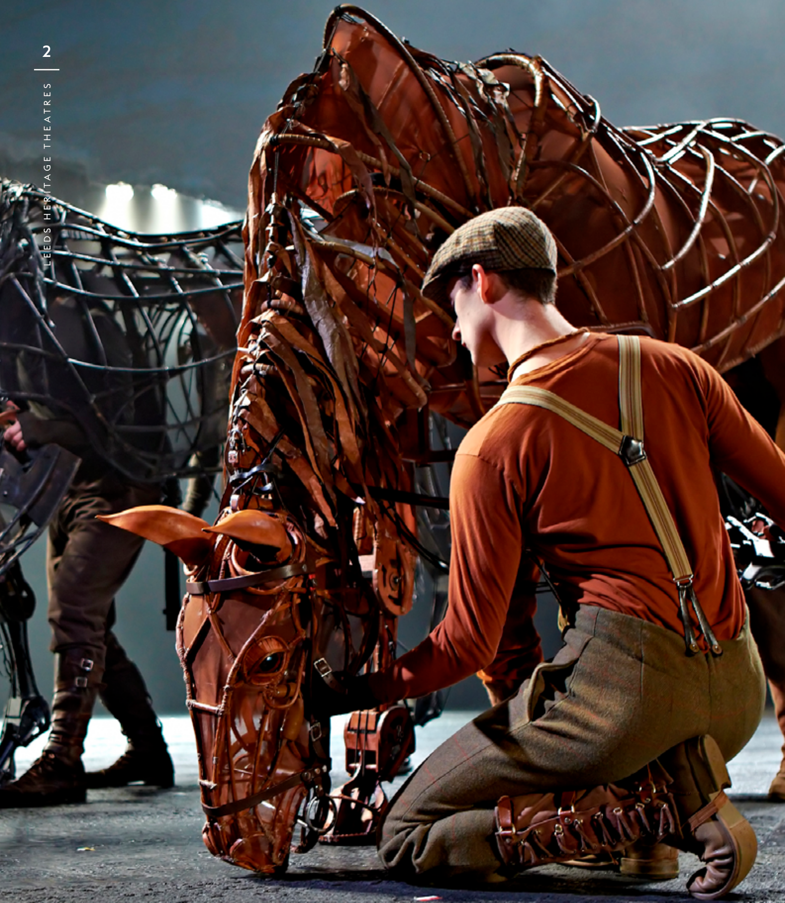
War Horse